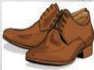
FOOTWEAR and PARTS OF FOOTWEAR

The structure of products is very wide, from light and heavy clothing, sporting goods, upholstery, machines, protective equipment, uniforms, medical programs, to home textiles. The mostly export products: