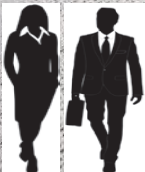
SUITS, JACKETS, TROUSERS, SKIRTS