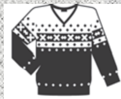
KNITTED SWEATERS, KNITTED GARMENT