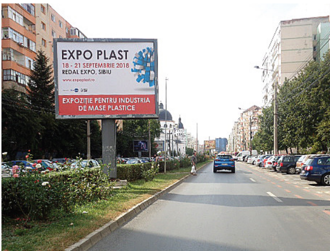
Outdoor Outdoor banners in Sibiu and main cities in Romania

EXPOPLAST makes use of all ATL & BTL means in order to bring to the event its targeted audience: